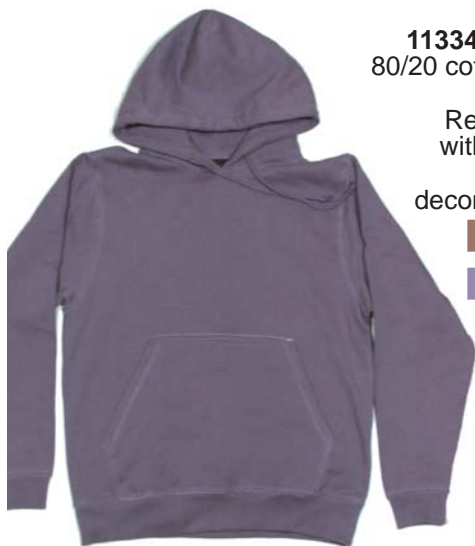
113349 Surplus Hood 80/20 cotton/polyester fleece 8.85 oz Relaxed-fit hood with handwarmer pocket and deconstructed seams