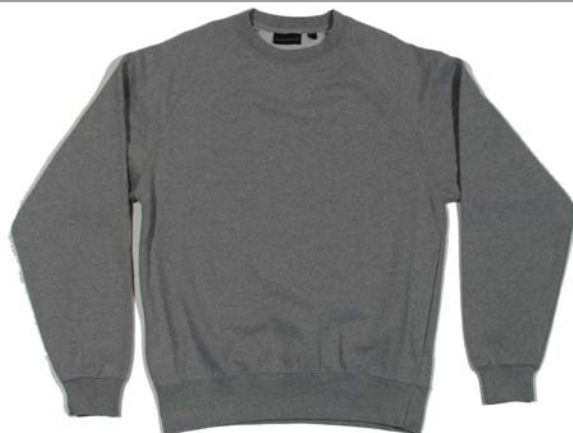
113452 Comeback Crew 50/50 cotton/polyester fleece. Athletic-cut crew.

■ J03-Oxford ■ J80-Navy ■ J99-Black ■ J30-Garnet