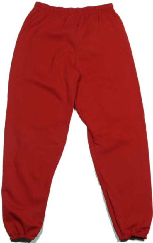
114452 Penalty Pant