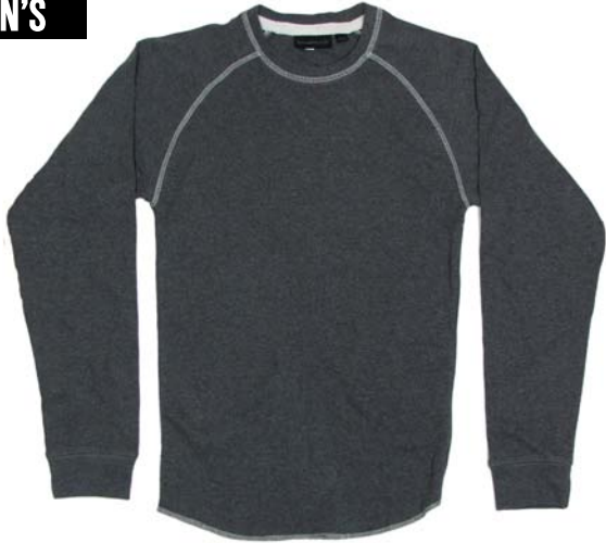
119204 Long John 100% cotton waffle.

Slim-cut raglan long sleeve pullover with shirt tail bottom and contrast stitching.