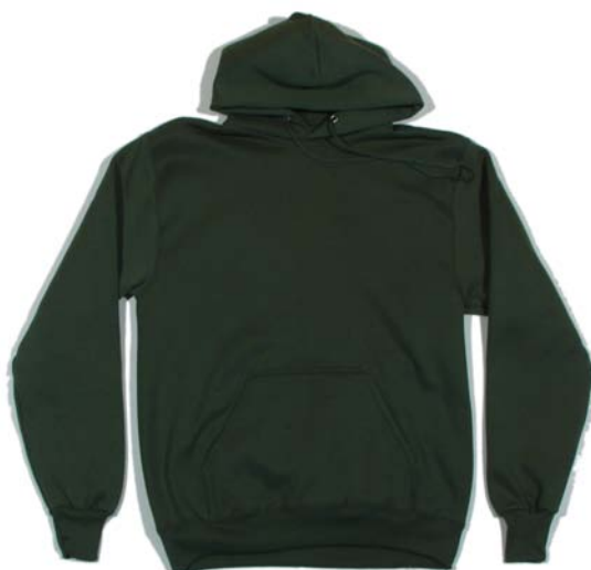
113450 Halftime Hood 50/50 cotton/polyester fleece. 9 oz Athletic-cut hood with handwarmer pocket.

■ J03-Oxford ■ J80-Navy ■ J99-Black ■ J30-Garnet