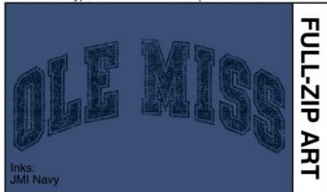
1L1SJ140 - Typical Screenprint - Full Chest 13"wide