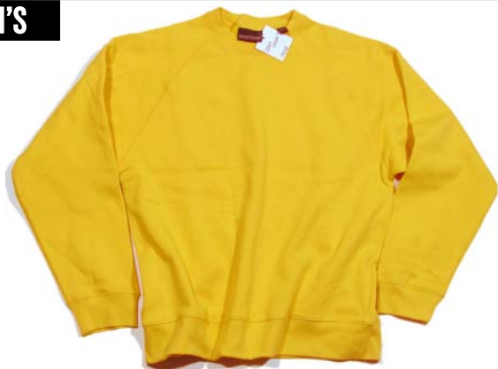
1123435 Sport Crew (J20-Gold) 1123436 Sport Crew (J40-Orange) 80/20 cotton/polyester fleece. Sport-cut raglan sleeve, side-seamed sweatshirt.