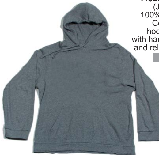
119208 Sloppy Joe (J03-Oxford) 100% cotton waffle. Cotton waffle hooded pullover with handwarmer pocket and relaxed waistband.